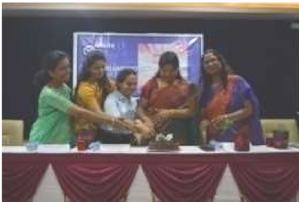
International Women's Day celebration at TGPCA