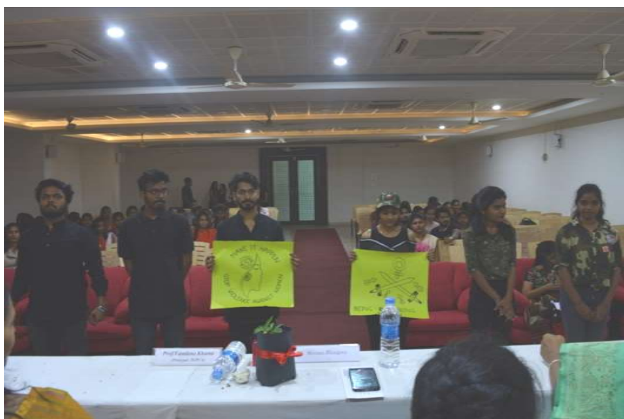
International Women's Day celebration at TGPCA