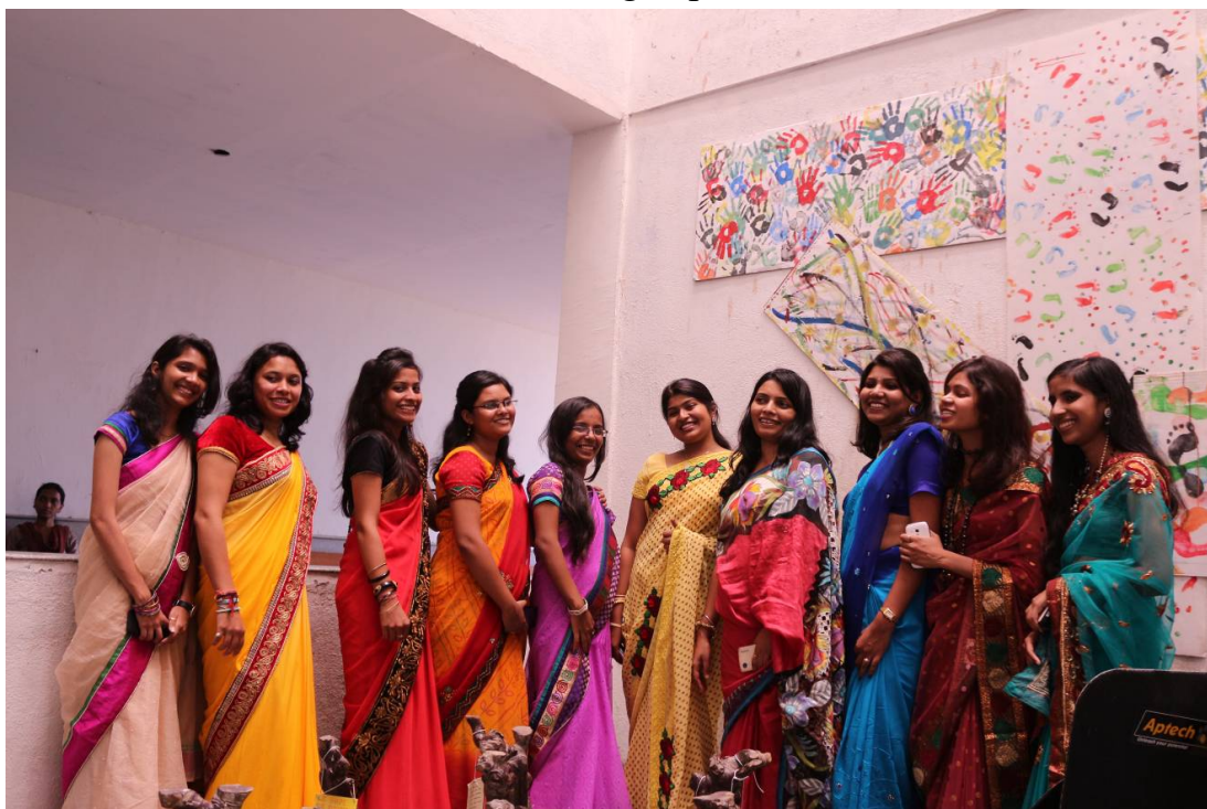
Faculty of TGPCA celebrating Navratri