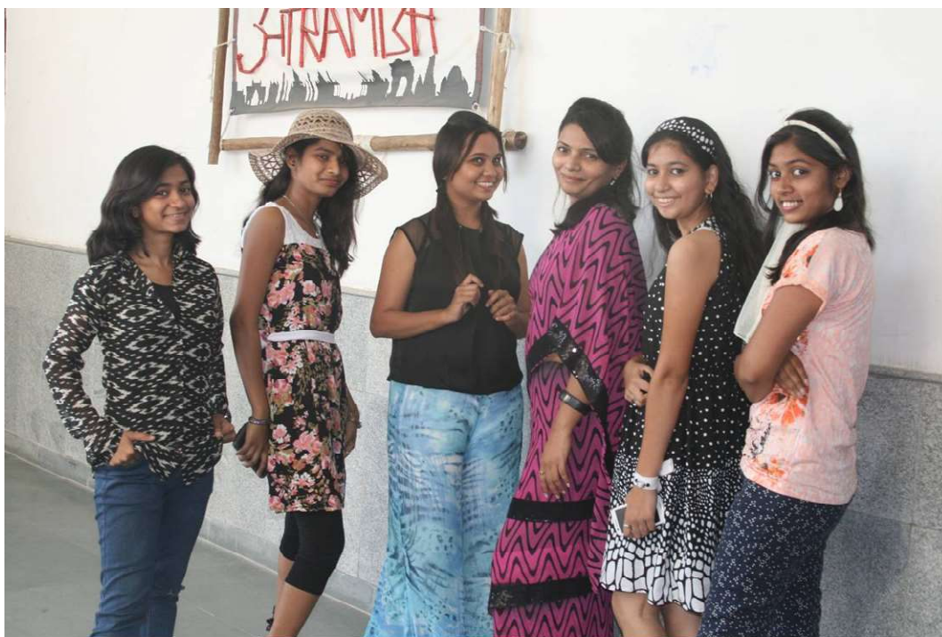
International Women's Day celebration at TGPCA