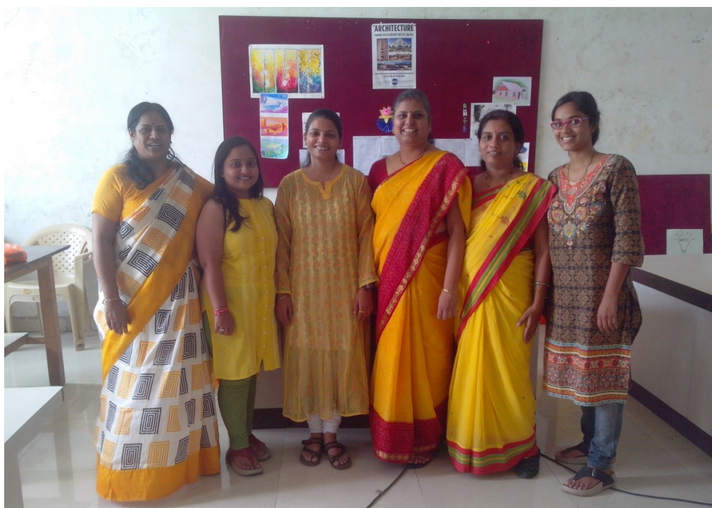
International Women's Day celebration at TGPCA