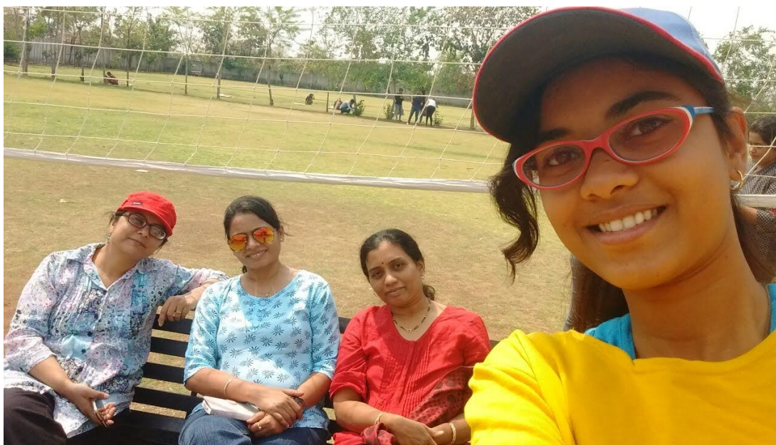
Sports Day organised for women of TGPCA