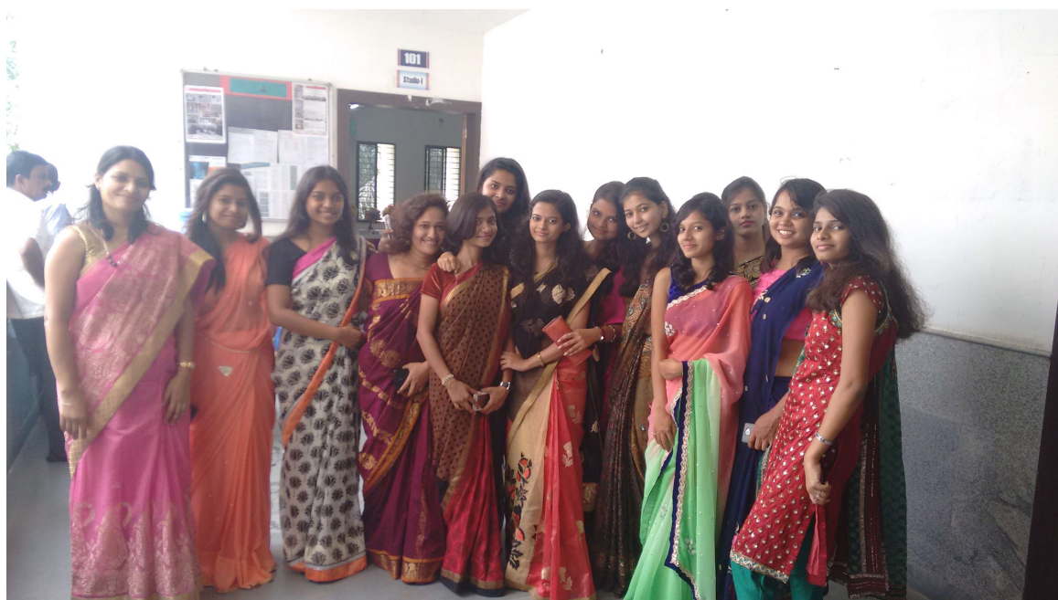
International Women's Day celebration at TGPCA