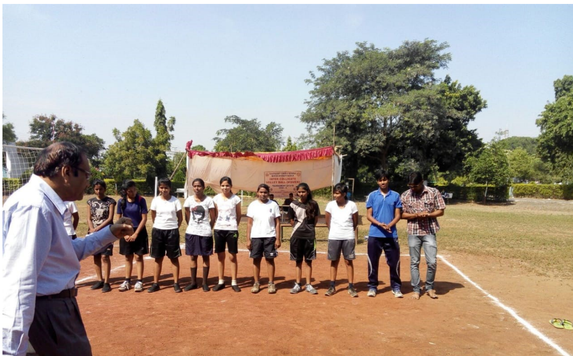
Sports Day organised for women of TGPCA

PRINCIPAL Tulsiramji Gaikwad-Patil College of Architecture, Nagpur