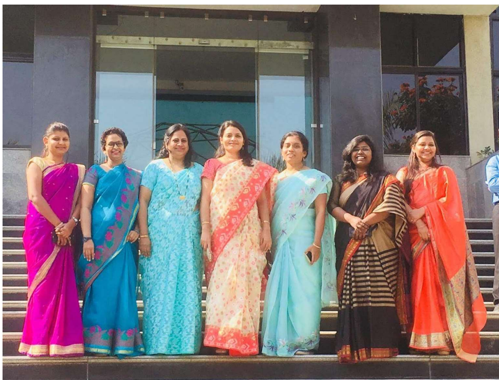
Faculty of TGPCA celebrating Sankranti