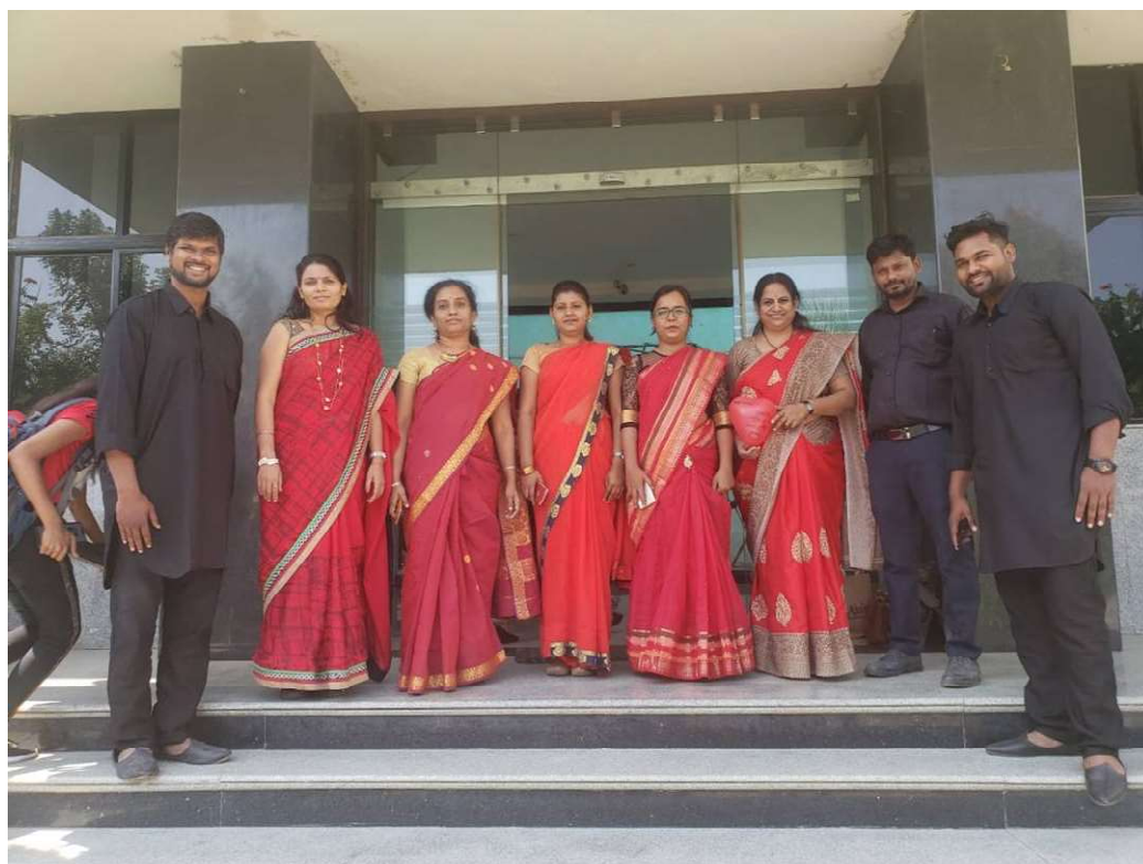
Faculty of TGPCA celebrating Navratri